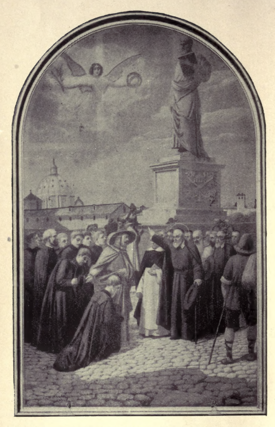
"Salvete Flores Martyrum" St. Philip blessing the future martyrs